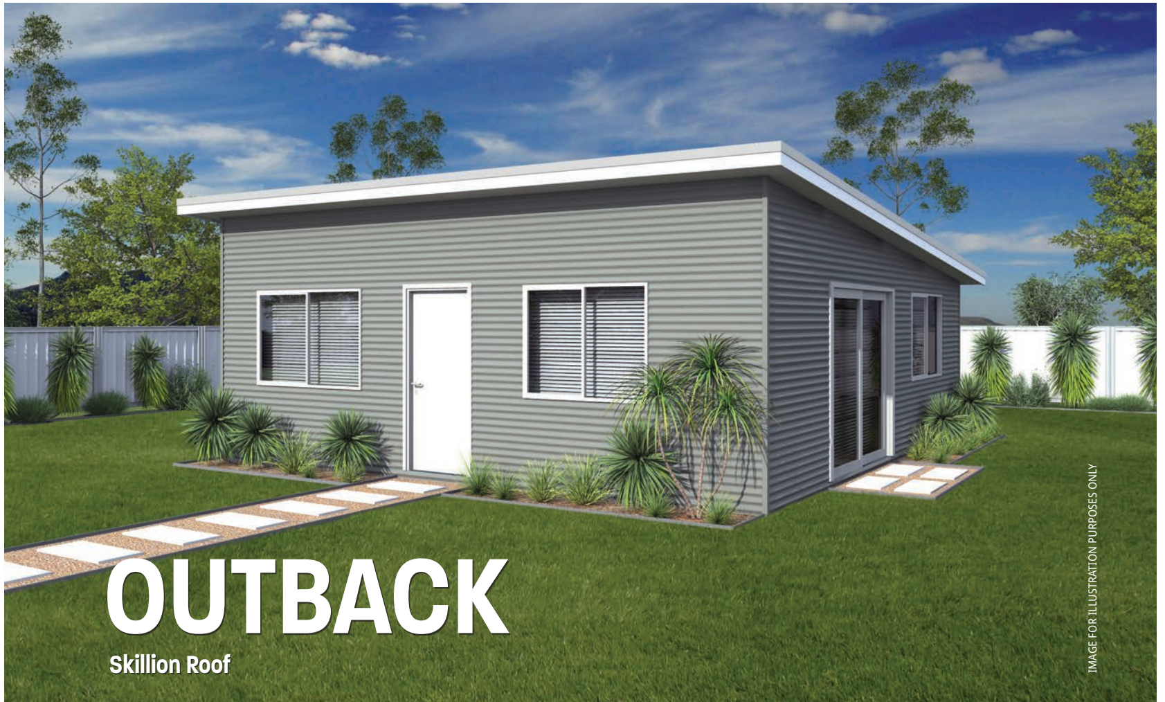
IMAGE FOR ILLUSTRATION PURPOSES ONLY