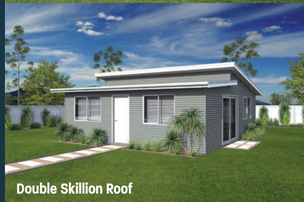
Double Skillion Roof